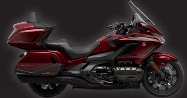
BORDEAUX RED METALLIC