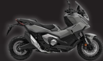
MATTE DEEP MUD GRAY