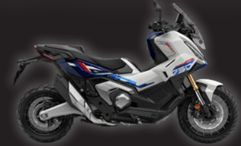
MATTE PEARL GLARE WHITE